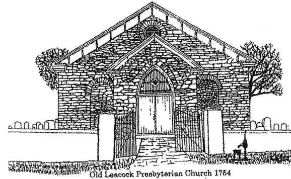
Old Leacock Presbyterian Church 1764

First met in Leacock Township in 1724, recognized by the Synod in 1740, moved to Paradise in 1840.