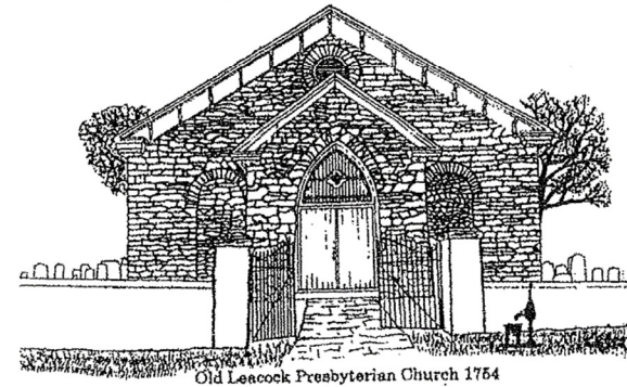
Old Leacock Presbyterian Church 1764

First met in Leacock Township in 1724, recognized by the Synod in 1740, moved to Paradise in 1840.